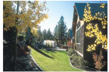
Use grass and driveways as fuel breaks from the house.