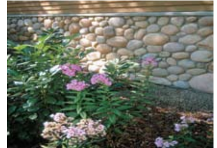
Use faux brick and stone finishes and high-moisture-content annuals and perennials.