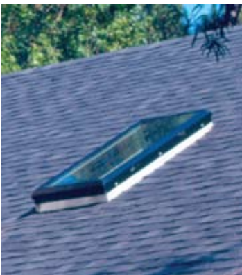
Use glass skylights; plastic will melt and allow embers into the home.