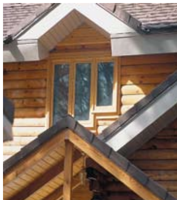
Enclose eaves and soffits.