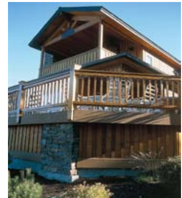
Enclose under decks so firebrands do not fly under and collect.